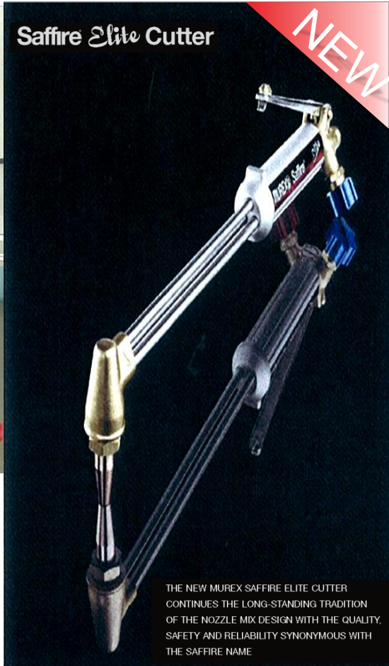
Saffire Elite Cutter

THE NEW MUREX SAFFIRE ELITE CUTTER CONTINUES THE LONG-STANDING TRADITION OF THE NOZZLE MIX DESIGN WITH THE QUALITY, SAFETY AND RELIABILITY SYNONYMOUS WITH THE SAFFIRE NAME